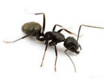
Foraging Fire Ants